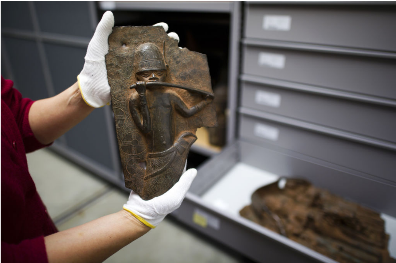
A small brass relief plate from the Benin Empire depicting royal hornblowers from a drawer of a rolling shelf in the depot of the Dresden State Art Collections in Dresden.