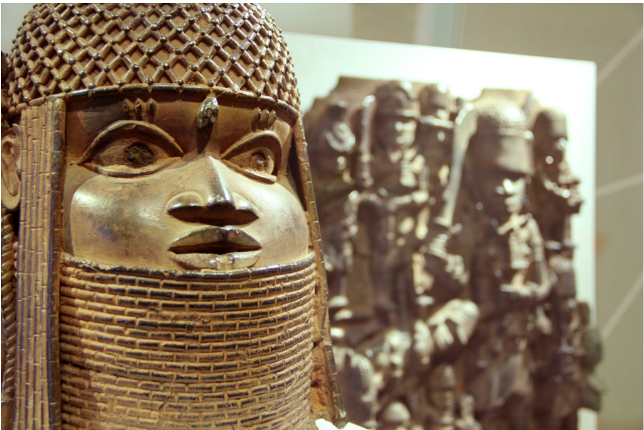
Exhibition view of “Looted Art? The Benin Bronzes” at MKG in Hamburg.

Initiatives: We are a member of the Benin Dialogue Group and are committed to working with other museums across Europe and representatives of the Edo State Government, the Royal Court of Benin, and the National Commission for Museums and Monuments, Nigeria, sharing information and knowledge and working towards a major reunion of the Benin works of art in Benin City. We are also working with the Digital Benin project to understand and share more about the provenance of the Benin objects in our care.