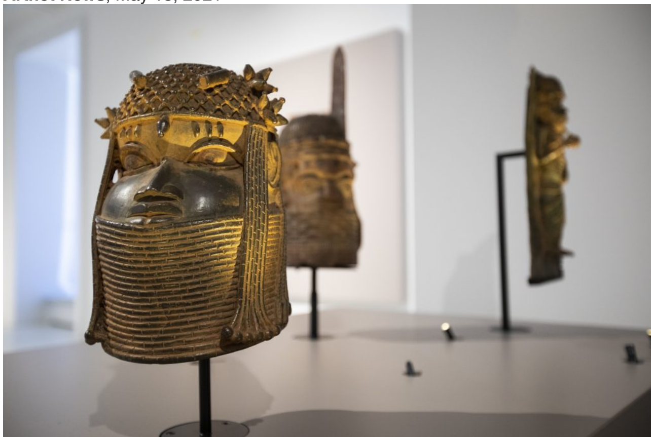
Benin bronzes "MEMORY, Momente des Erinnerns und Vergessens," Museum der Kulturen, Basel.

Germany's landmark announcement that it would begin to retribute Benin bronzes as soon as 2022 sent ripples through museum communities around the world. The contentious objects, known to have been looted from the Benin Royal Palace in 1897, are scattered across some of the most prominent museums the world over. From institutions like the Metropolitan Museum in New York, which holds 163 pieces, to the University of Pennsylvania's Museum of Archaeology and Anthropology, which holds 100