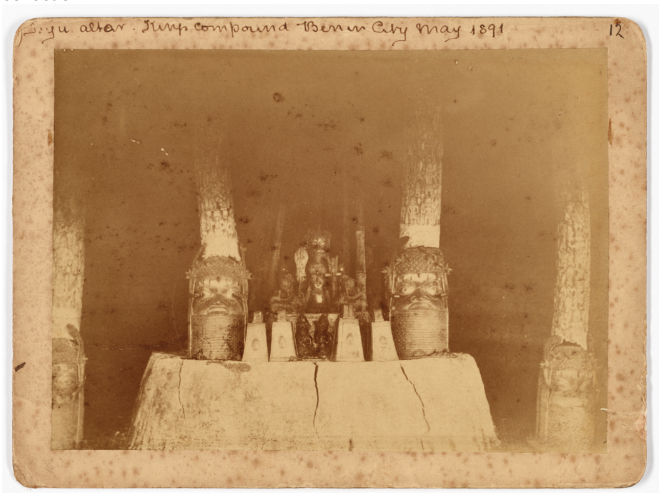
Photograph of an ancestral shrine at the Royal Palace, Benin City taken during the visit of Cyril Punch in 1891.

Artnet News reached out to 30 museums known to hold Benin bronzes to ask for an update on their position on restitution, and the status of objects in their collection.