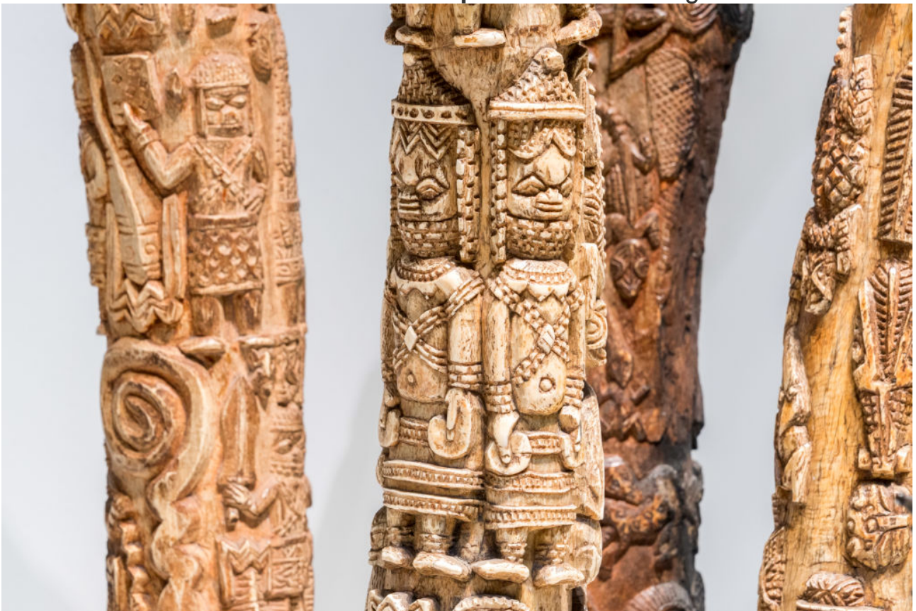
Carved elephant tusks looted by British soldiers from the Kingdom of Benin in 1897 are displayed in the “Where Is Africa” exhibition at the Linden Museum on May 05, 2021 in Stuttgart, Germany.

Initiatives of which the museum is a part: Member of Digital Benin